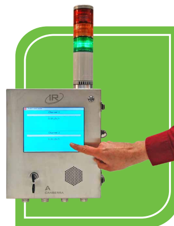
Model iR7040 wall-mount ratemeter

The iR Ratemeter supports an enhanced Source check functionality, allowing the user to manually or automatically perform source checks of attached probes and detectors with that capability. The source check results can be plotted for long term performance and stability verification. Individual tests can also be compared to the expected value to alarm on out of specification responses.